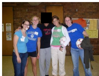
Above: OT & PT Students engaged the kids at Blackburn in a kickball game.

This program is made possible through funding by the Nebraska Crime Commission.