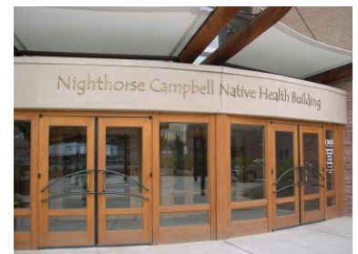
Above: Nighthorse Campbell Native Health Building at CU-Denver.