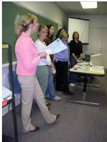
Above: PT & OT students share about their professions to OPS students.

In February 2006, OISSE held a Faculty Introductory Meeting for faculty members identified across the SPAHP & the School of Nursing with an interest in interprofessional community engagement activities. After an introduction to OISSE, faculty members in attendance were invited to join OISSE as either an OISSE Faculty Associate or OISSE Faculty Affiliate.